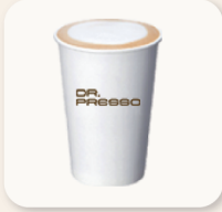
HOT Caffè latte