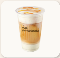
ICE Caramel macchiato