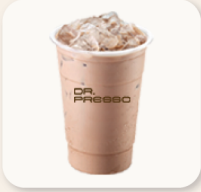
ICE Caffè mocha