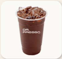
ICE Chocolate milk