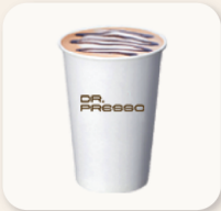
HOT Chocolate milk