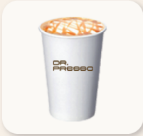
HOT Caramel macchiato