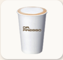
HOT Vanilla latte