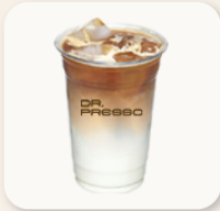
ICE Vanilla latte