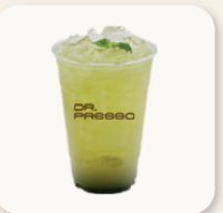
Green grape ade