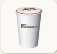
HOT Caffè mocha