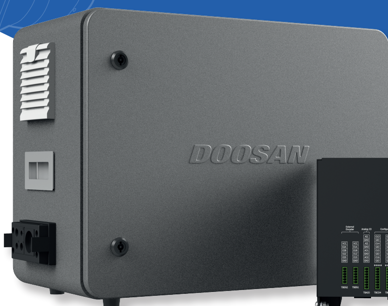
*CS-11P (with controller case)

The new controller platform that seamlessly integrates all Doosan robots, delivering enhanced speed and performance for more versatile applications.